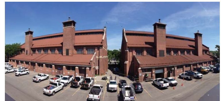
The Booth Yard in the South of Eastern Area