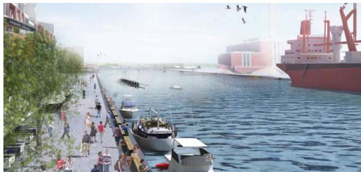
Artistic Rendering of the Ship Channel in the Port Lands